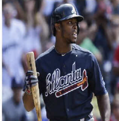
Justin Upton Road Warriors