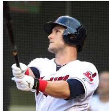
Beefer C Yan Gomes was 2-3 in the Series, with a game-winning 2b and a HR.

Otters 4-10-2 L- Brandon Kintzler 0-1. Beefers 5-6-0 W- Ryan Cook 1-0. HR J.J. Hardy (1), Adrian Beltre (1).