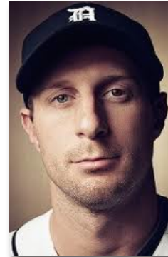
RHP Max Scherzer won two games as the Beefs made it past the Taz Devils in the playoffs first round.

Devils 2-7-1 L- Alex Cobb 1-1. HR Will Venable (3). Beefs 4-8-0 W- Hishashi Iwakuma 1-1. Sv Bobby Parnell (1). HR Matt Wieters (1).